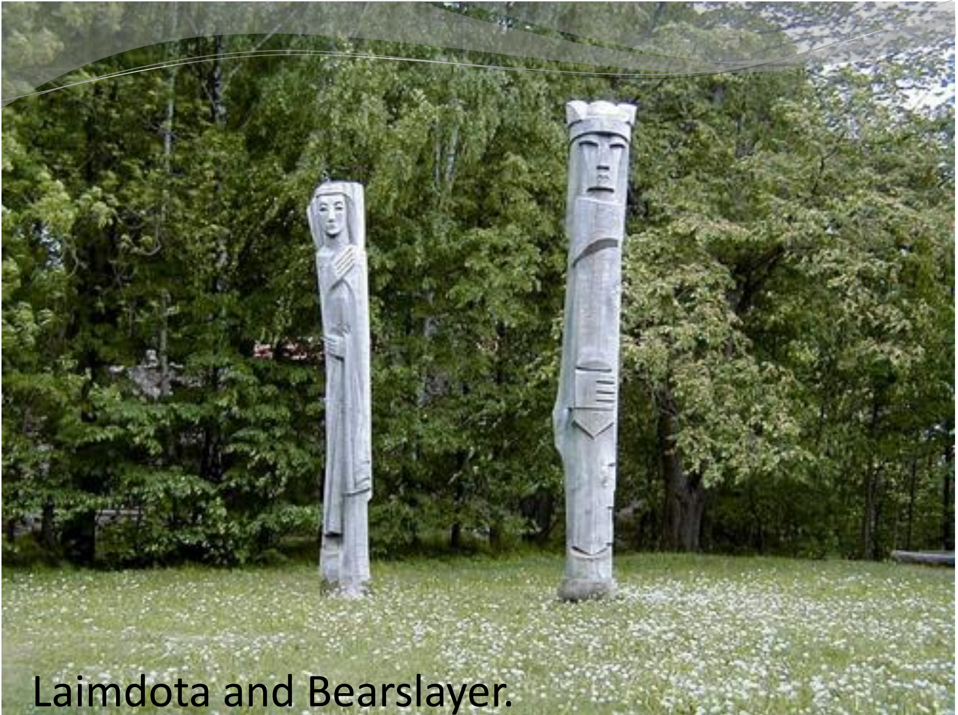
Laimdota and Bearslayer.