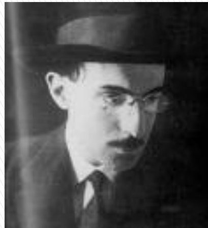
Fernando Pessoa 1888-1935