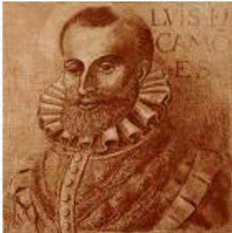
Luís de Camões