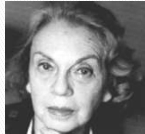
Sophia de M. Breyner Andresen